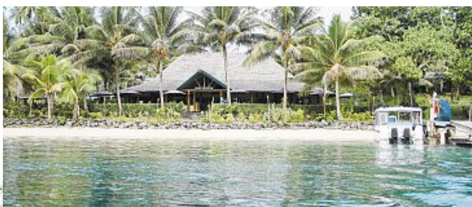
ESCAPE THE RAT RACE: Vanuatu offers visitors astoundingly calm beaches, the remains of World War II United States military installations, and the exquisite Aore Island Resort.